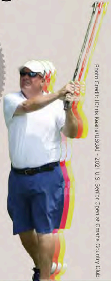
2021 U.S. Senior Open at Omaha Country Club